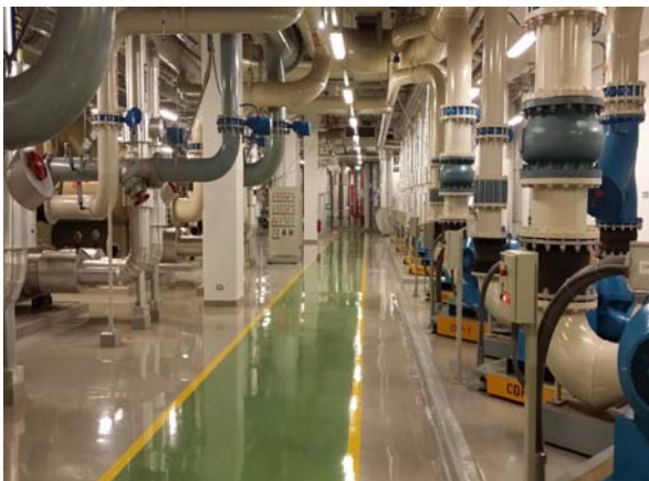
HVAC System - Low Power Consumption Chiller Plant