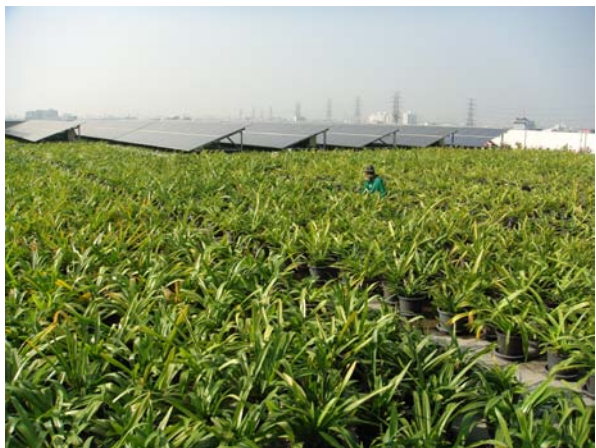
Solar Cells on Roof Top - Clean Energy