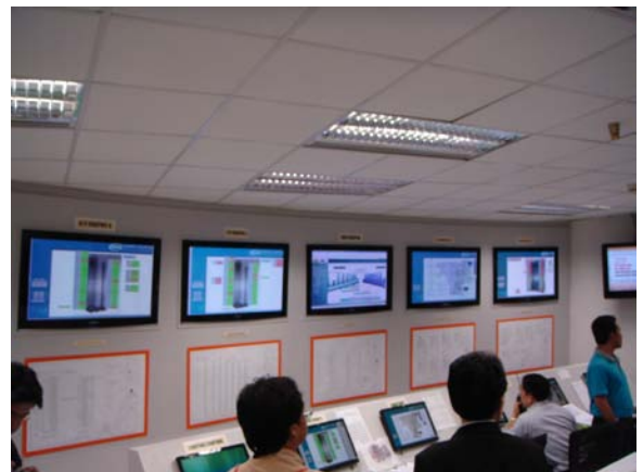
Building Automation System (BAS) - Full Functions